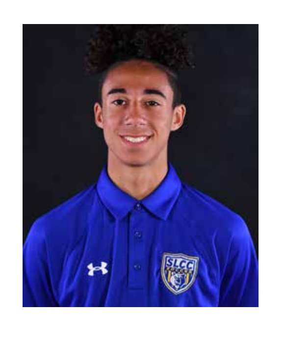
F R E S Н M