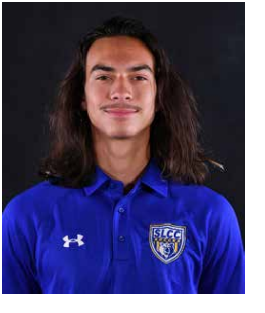
F R S Н M E N