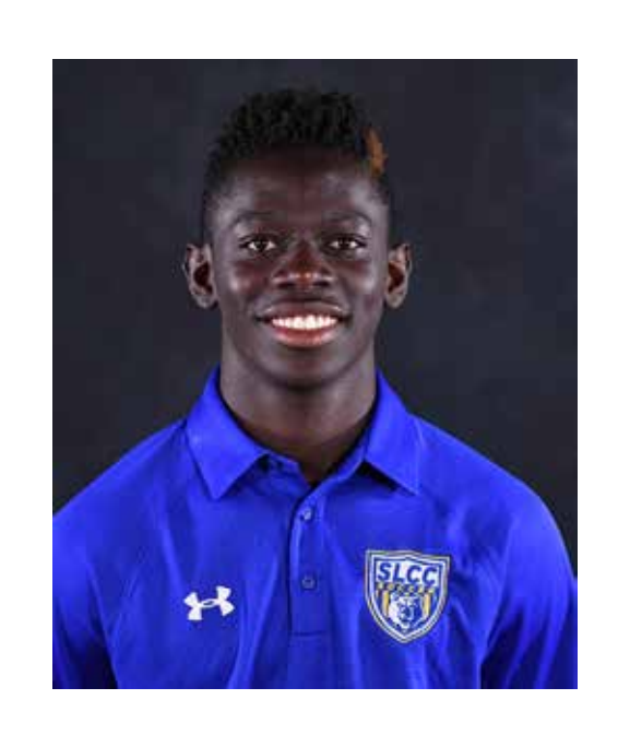
F R E S H M E N